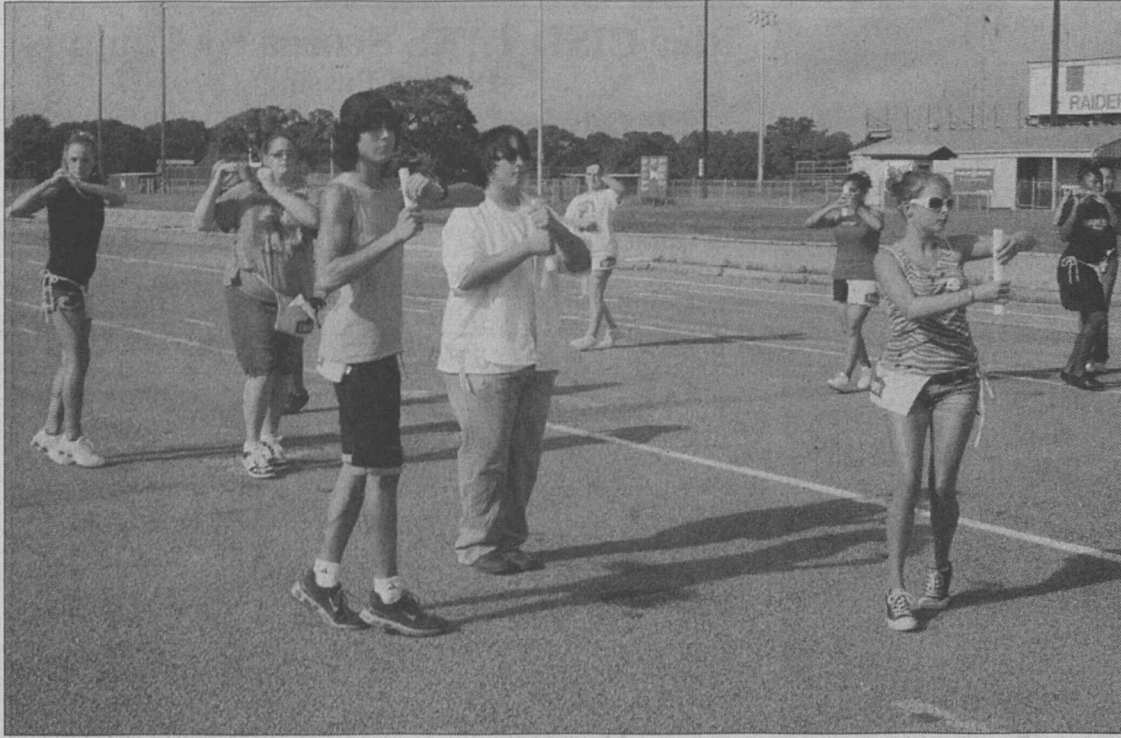
Members of the Raider Band work on their marching in preparation for the upcoming season.